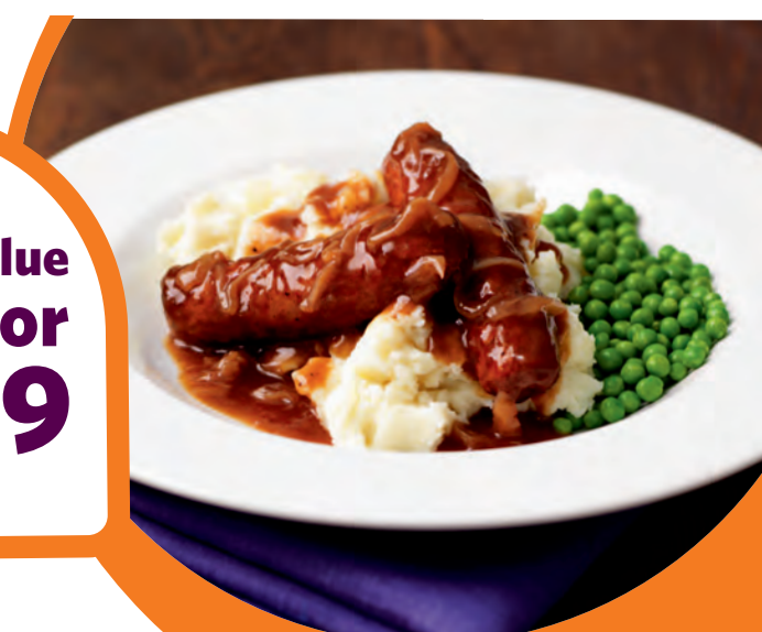
Sausage & Mash

Our Great Value Meals are available all day, every day.