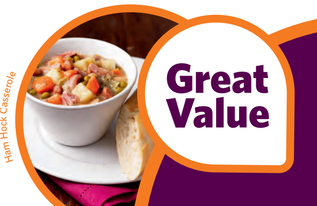
Ham Hock Casserole