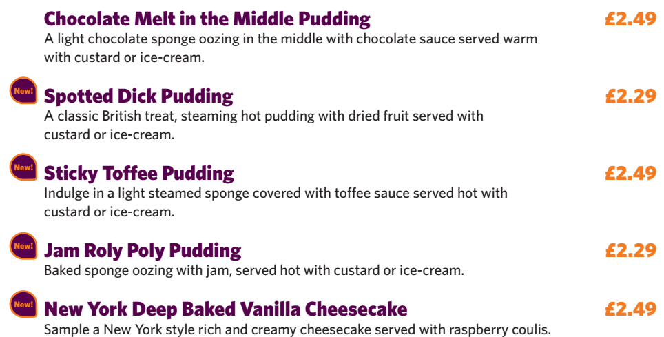
New York Deep Baked Vanilla Cheesecake

Satisfy your sweet tooth and treat yourself.